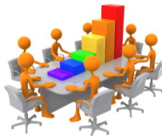
Dr. M.B.Kadam Dept. of AS&H

Quantum computers developed till date are at small scale using qubits but are suffering from decoherence & errors due to variety of factors involving steps in fabrication processes & materials used. It is also crucial to understand the role of surfaces & interfaces & especially surface passivation in improving the quality of superconducting qubits. This can be achieved by developing methods for correlating qubit measurements with direct materials characterization & measurements. Further, one needs to develop materials to improve the existing platforms or look for new platforms. Again it requires the novel